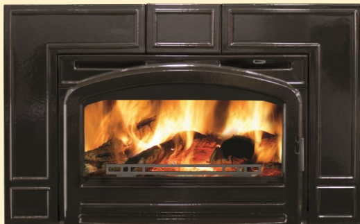
TI3TN-1 Traditional Wood Insert

Self-contained and more efficient than an existing woodburning fireplace opening, a woodburning insert is a great way to ensure that your home is running more productively. Venting out the existing chimney, woodburning inserts ensure that drafts can no longer enter your home. These inserts are built to exceed standards for clean-burning which ensures loads of even heat and comfort for hours on end. Whether you go with a contemporary, clean-lined look or something a little more on the traditional side, there is nothing compared to the joy and scent of building your own wood-burning fire in a woodburning insert.