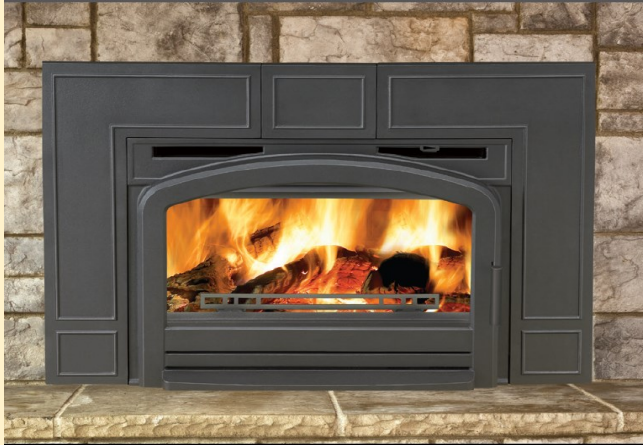
TI3T-1 Traditional Wood Insert