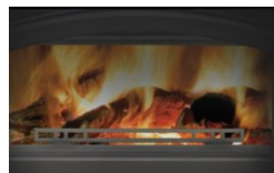
Removable Log Retainer