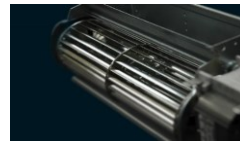
Dual Blower Included