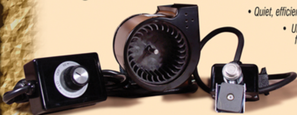
AD1 SINGLE (84 CFM)