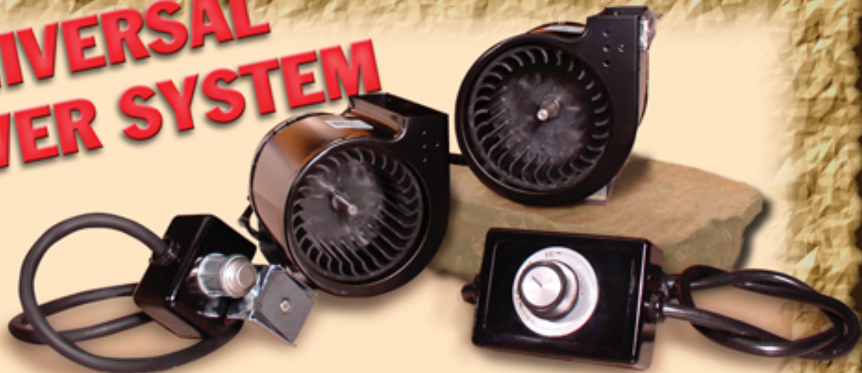
AD2 DUAL (168 CFM)