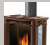
EASILY CONVERTS FROM REAR VENT TO TOP VENT