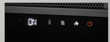
TOUCH CONTROL PANEL