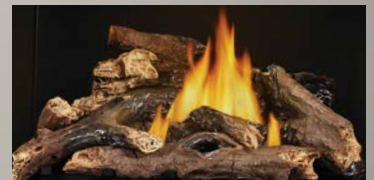
SPLIT OAK LOG SET INCLUDED