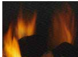
Reflective Black Glass