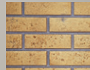
DECORATIVE SANDSTONE BRICK PANELS