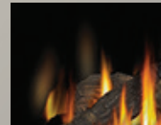
MIRRO-FLAME™ PORCELAIN REFLECTIVE RADIANT PANELS