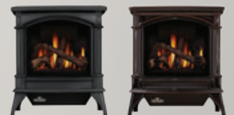
METALLIC BLACK AND MAJOLICA BROWN FINISHES AVAILABLE