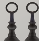
ANDIRONS PAINTED BLACK