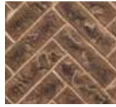
Tavern Brown Herringbone (single-sided only)