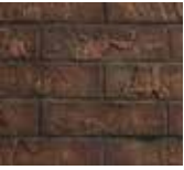
Cottage Red (see-through only)