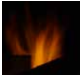
Reflective Black Glass (single-sided only)