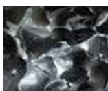
Iced Fog Glass