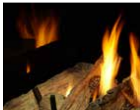
Reflective Black Glass