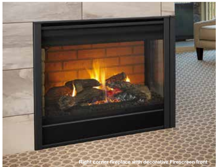
Right corner fireplace with decorative Firescreen front

Corner Fireplaces – Available in right and left corners. Same remote control and fan options available.