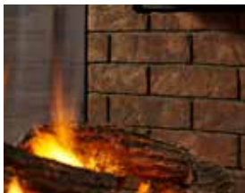
Weathered Traditional Brick

Customize the interior of your fireplace with this alternative style of decorative lining.