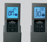
REMOTE CONTROL (OPTIONAL)