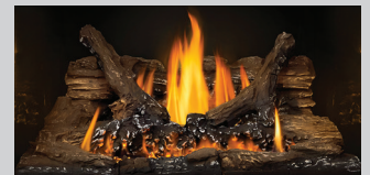
SPLIT OAK LOGSET INCLUDED