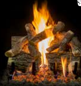
2-Burner Arizona Weathered Oak Charred 18"

Arizona Weathered Oak Charred (AWOC) Available in 18", 24", 30", 36" and 42". Front View and See-Through. Burner compatibility 2 and 3 burner.