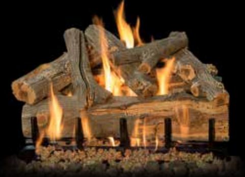
2-Burner Arizona Juniper 24"