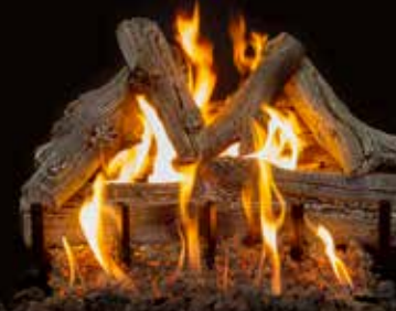
2-Burner Arizona Western Driftwood 21"

Arizona Western Driftwood (WD) Available in 18", 21", 24", 30", 36" and 42". Front View and See-Through. Burner compatibility 2 and 3 burner.