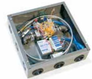
200K Natural Gas BTU Rating 320K Propane BTU Rating Item # EIS