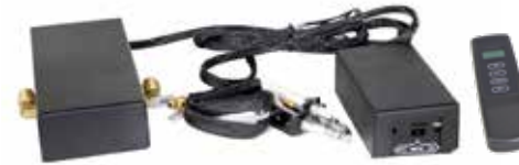
120K Natural Gas BTU Rating 140 K Propane BTU Rating Item # MVKEIKLP or MVKEIKN