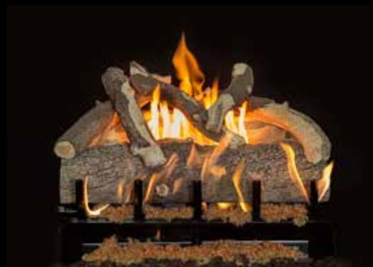
3-Burner Blue Pine Split 24"