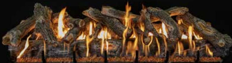
2-Burner Arizona Weathered Oak 60" Also available in 48"