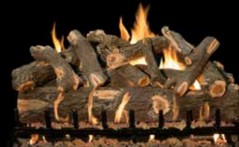
3-Burner Arizona Weathered Oak 42"