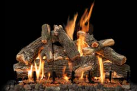
2-Burner Arizona Weathered Oak 36"