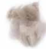
1 Gram Item # PEB-1