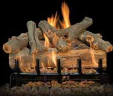
3-Burner Arizona Juniper 24"