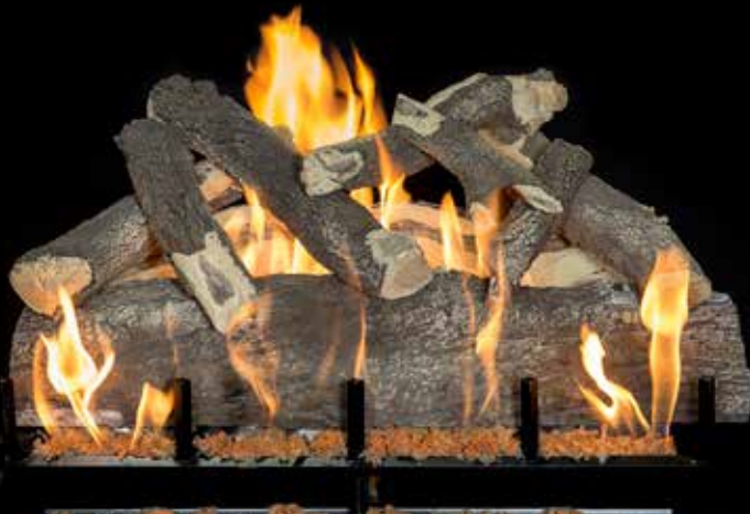
3-Burner Blue Pine Split 30"