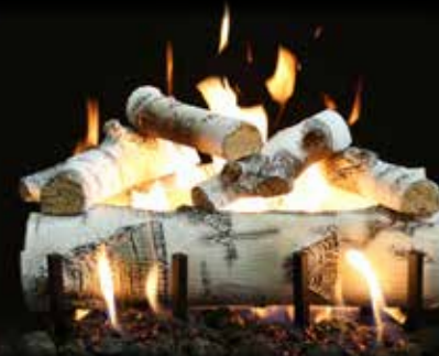
2-Burner Quaking Aspen 18"