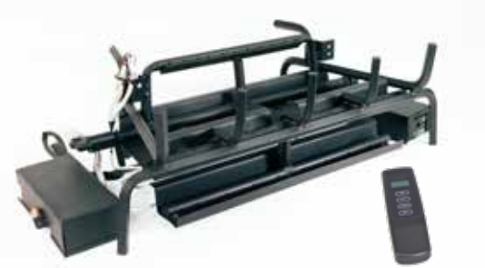
Assembled burner propane with battery electronic and remote system. 3BRN-##-***-MVKEI-GCRK