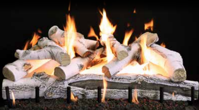
2-Burner Quaking Aspen 36"