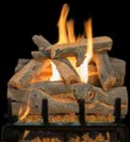
3-Burner Arizona Juniper 18"