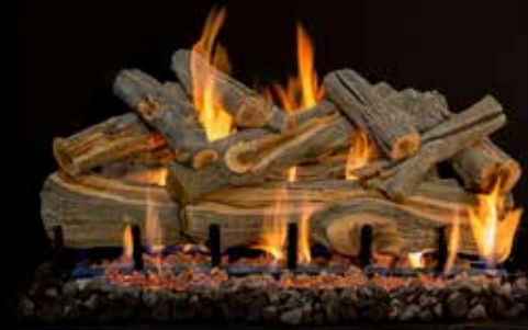
2-Burner Arizona Juniper 36"