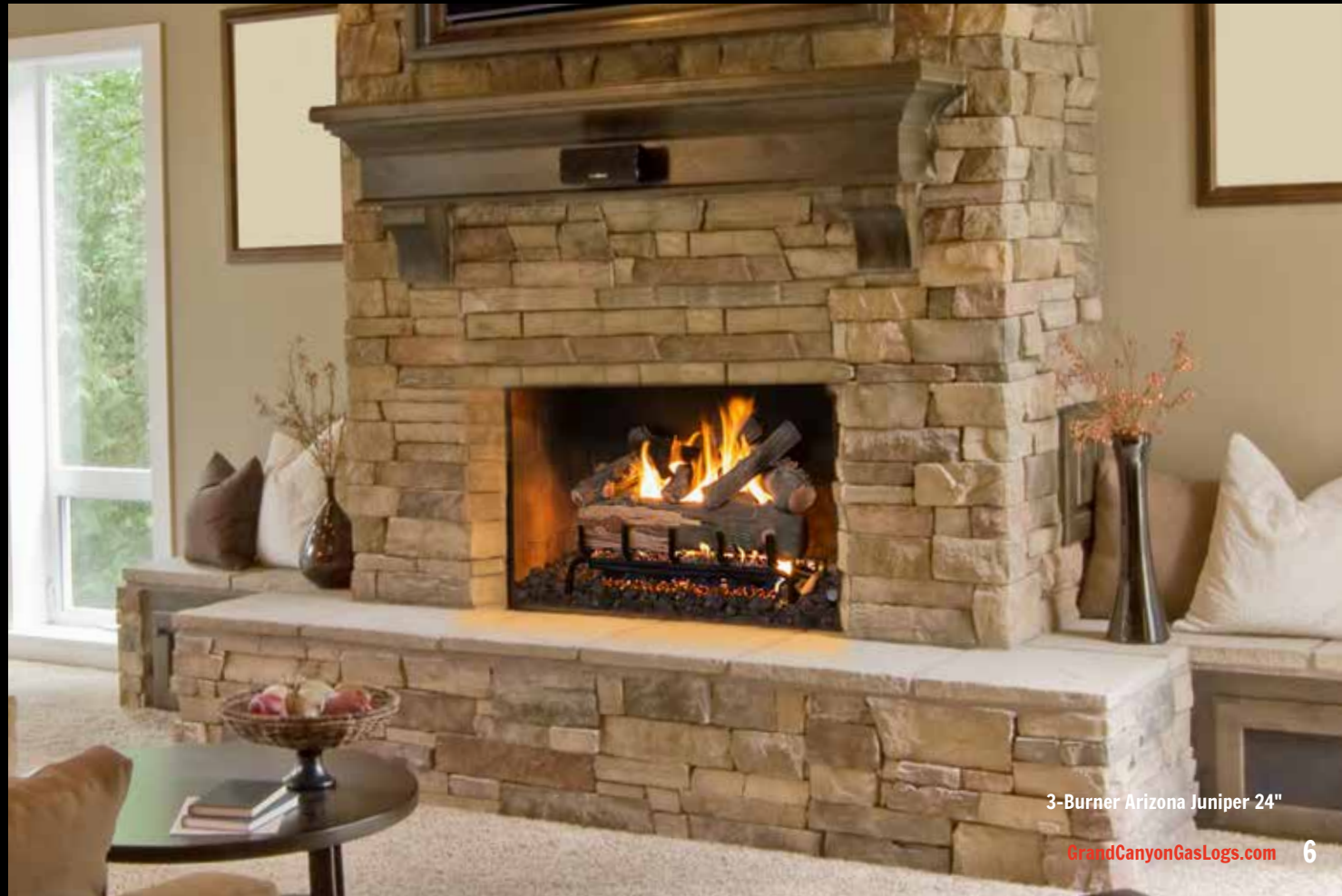
3-Burner Arizona Juniper 24"