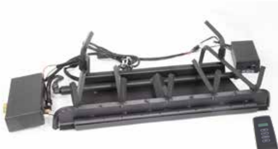
Assembled burner natural gas with battery electronic and remote system. 2BRN-##-***-MVKEI-GCRK