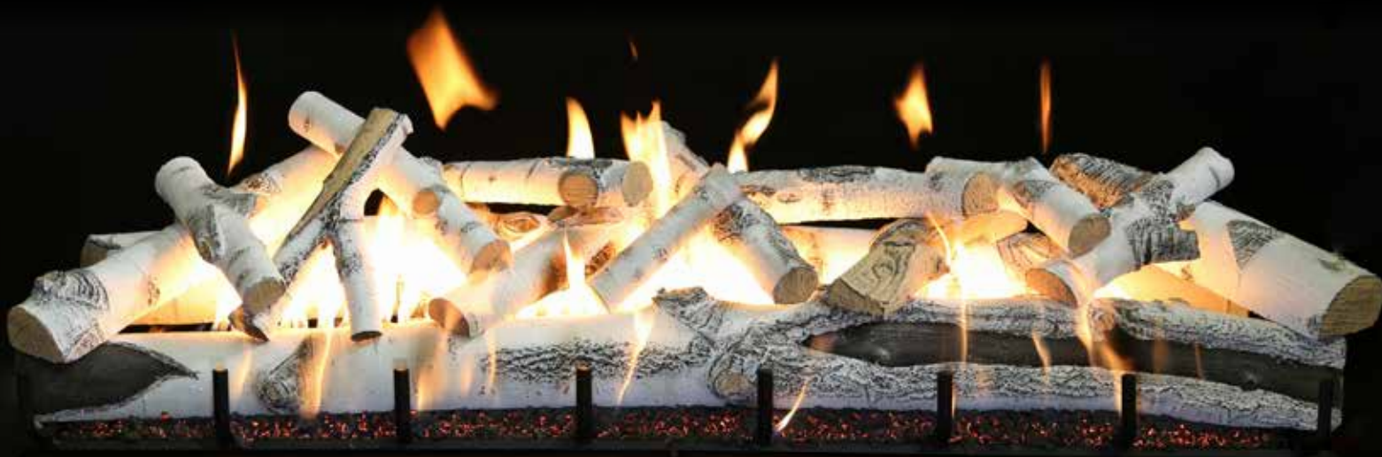
2-Burner Quaking Aspen 60"