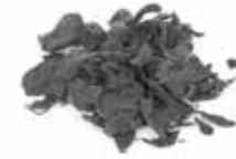
6 oz Bag Item # GLE-6B