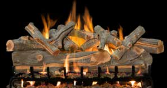
3-Burner Arizona Juniper 42"