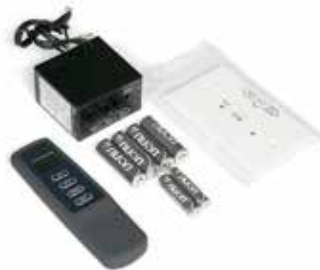
85K BTU Rating Item # GCRK