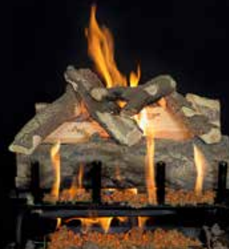
3-Burner Blue Pine Split 18"