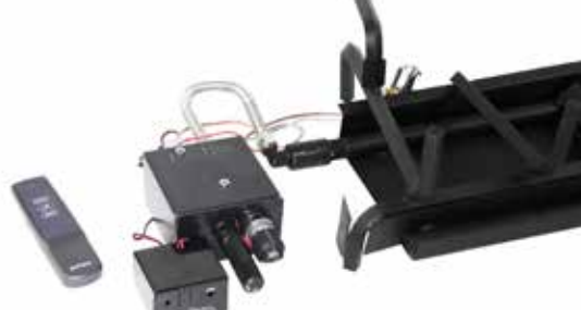
Assembled burner natural gas with modulating millivolt and remote system. 2BRN-##-***-MMVR