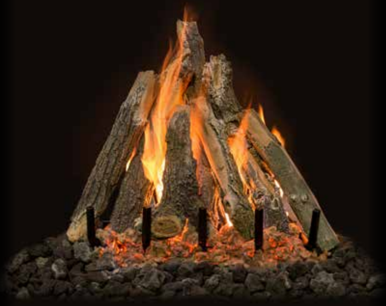
Kiva Arizona Weathered Oak (AWO)