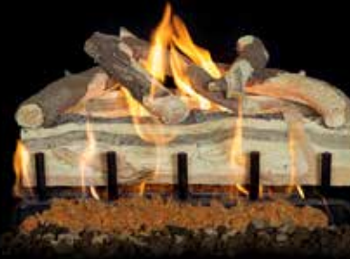
2-Burner Blue Pine Split 24"