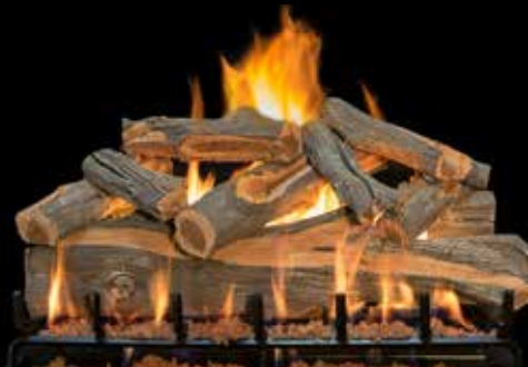
3-Burner Arizona Juniper 36"