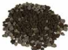
Lava Granules Available in 10 lb. Bags Item # HP-B-GR-10