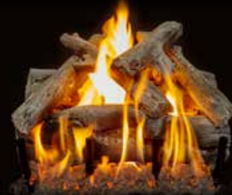
2-Burner Arizona Western Driftwood 18"

Arizona Western Driftwood (WD) Available in 18", 21", 24", 30", 36" and 42". Front View and See-Through. Burner compatibility 2 and 3 burner.