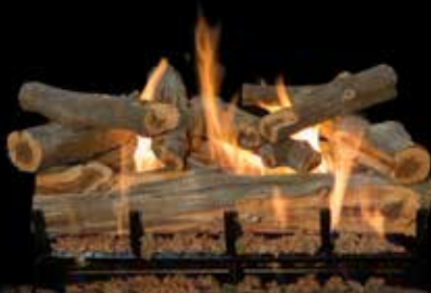
3-Burner Arizona Juniper 30"