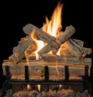
3-Burner Arizona Juniper 21"