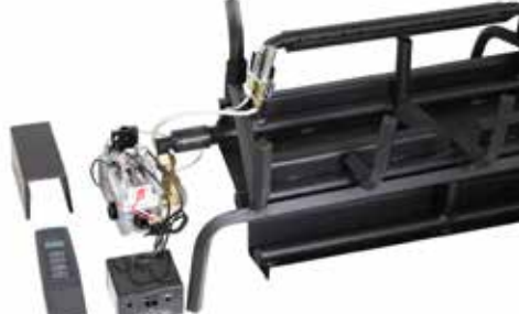
Assembled burner natural gas with millivolt and remote system. 3BRN-##-***-MVK-GCRK