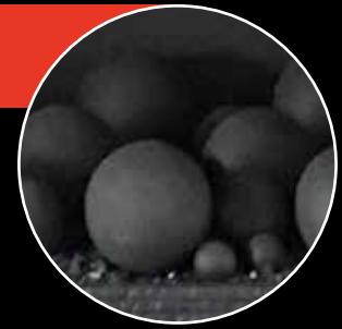
Fireplace Fiber Cannonballs Available in 2", 4", and 6".