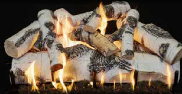
2-Burner Quaking Aspen 30"