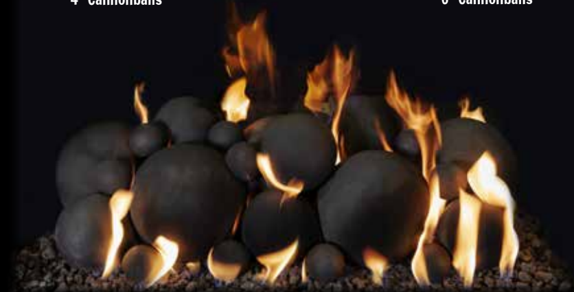
2", 4" and 6" mixed Cannonballs