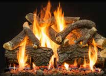
2-Burner Arizona Weathered Oak Charred 30"