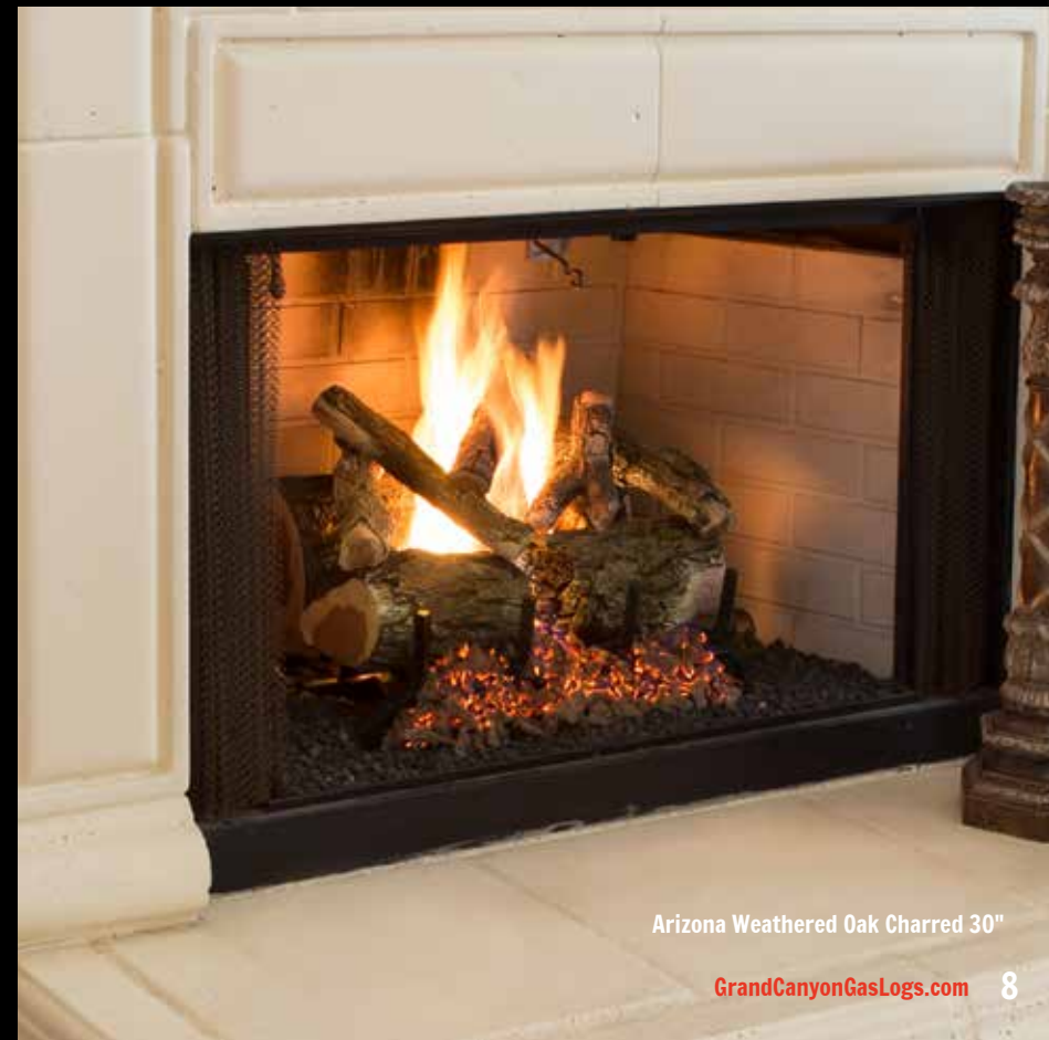
Arizona Weathered Oak Charred 30"