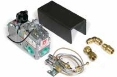
82K Natural Gas BTU Rating 110K Propane BTU Rating Item # MVQMKLP or MVQMKN