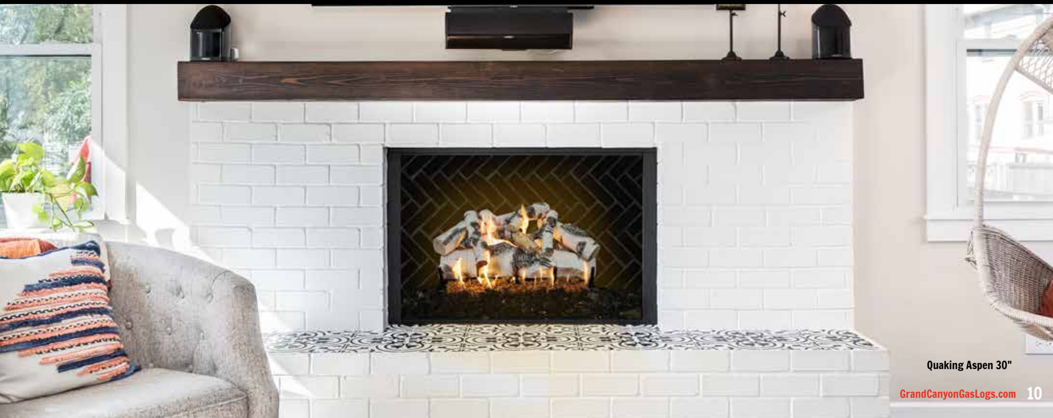
Quaking Aspen 30"