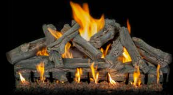
2-Burner Arizona Western Driftwood 42"