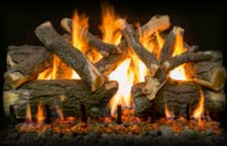
3-Burner Arizona Weathered Oak Charred 36"