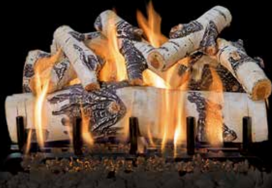
2-Burner Quaking Aspen 24"