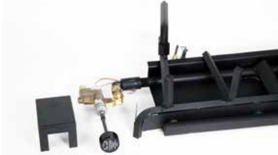
Assembled burner natural gas with safety pilot system. 2BRN-##-***-SP