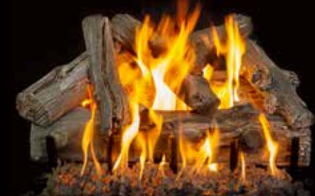
2-Burner Arizona Western Driftwood 24"