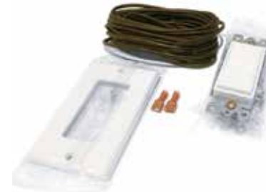
82K BTU Rating Item # GCWS