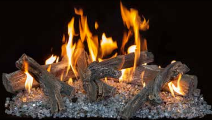
Glass Burner with 24" Driftwood Logs