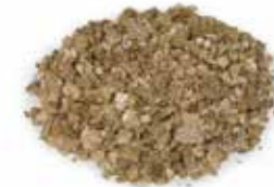
8 oz Bag Item # VEM-8