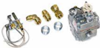
240K Natural Gas BTU Rating 320K Propane BTU Rating Item # HCMVQMKLP or HCMVQMKN