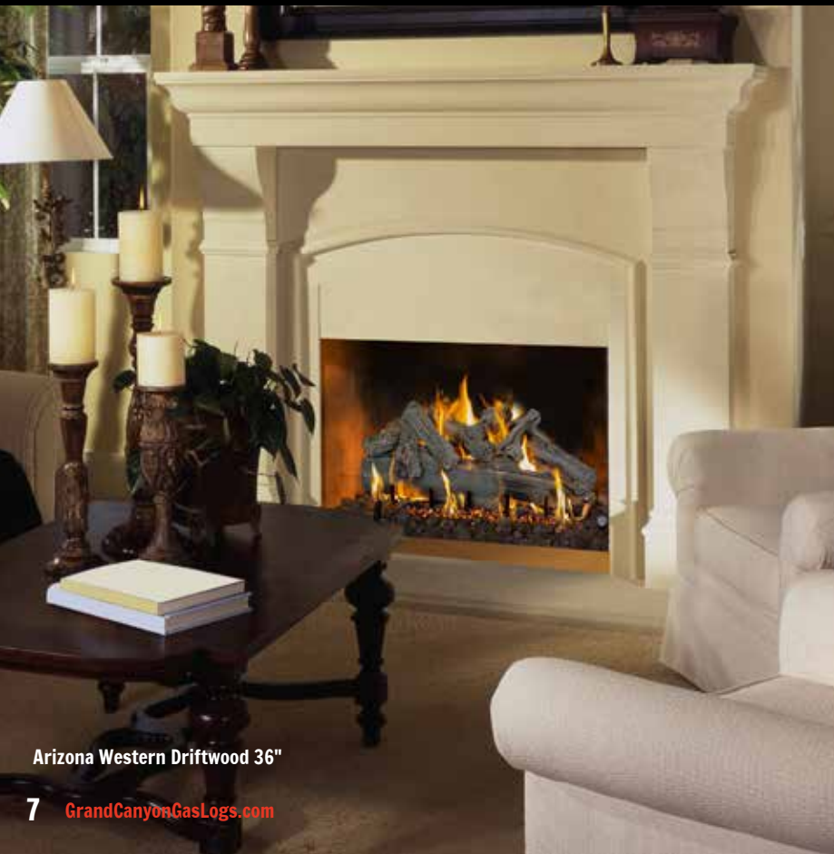
Arizona Western Driftwood 36"