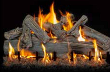
2-Burner Arizona Western Driftwood 36"