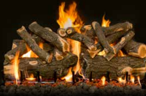
3-Burner Arizona Weathered Oak Charred 42"