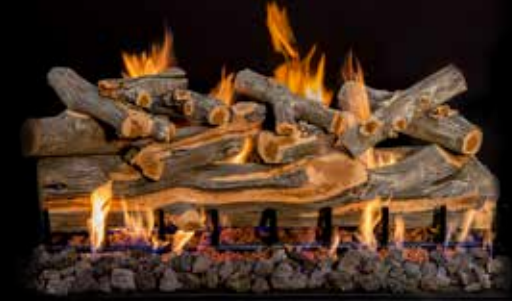
2-Burner Arizona Juniper 42"