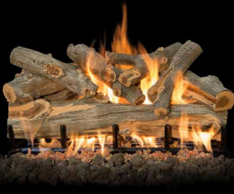
2-Burner Arizona Juniper 30"