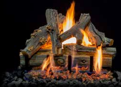
2-Burner Arizona Juniper 21"