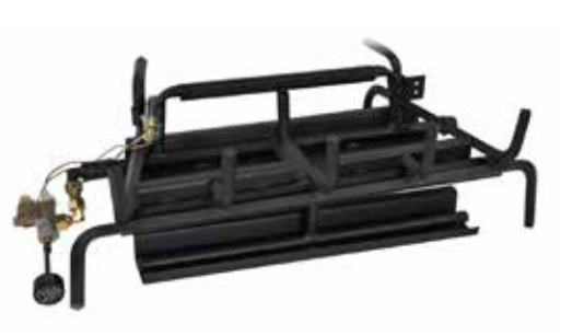
Assembled burner natural gas with safety pilot system. 3BRN-##-***-SP