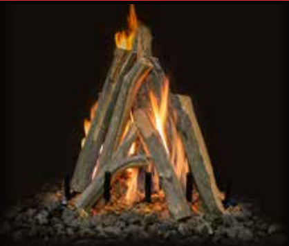
Kiva Arizona Juniper (AJ)