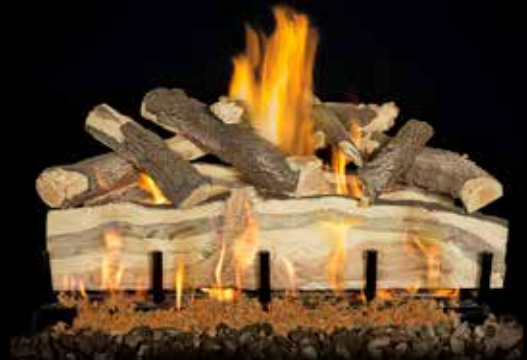
2-Burner Blue Pine Split 30"