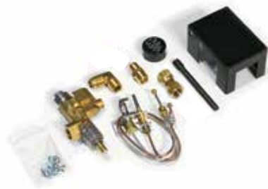
90K BTU Rating Item # SPQMKLP or SPQMKN