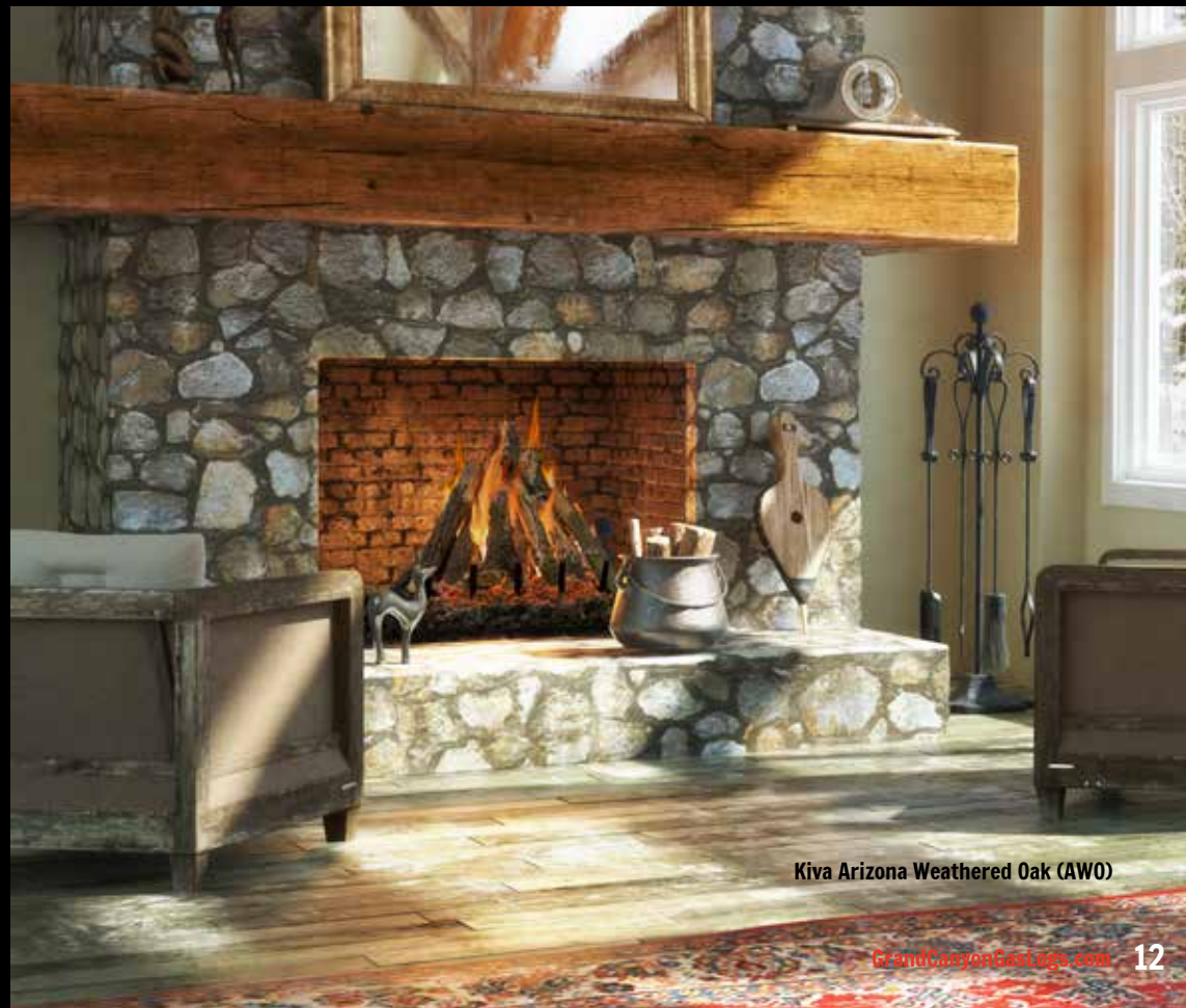
Kiva Arizona Weathered Oak (AWO)