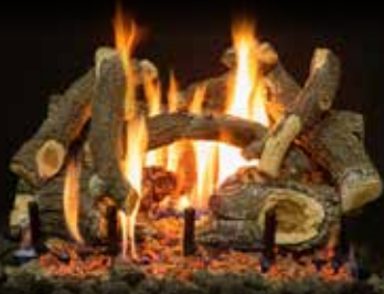
2-Burner Arizona Weathered Oak Charred 24"

Arizona Weathered Oak Charred (AWOC) Available in 18", 24", 30", 36" and 42". Front View and See-Through. Burner compatibility 2 and 3 burner.