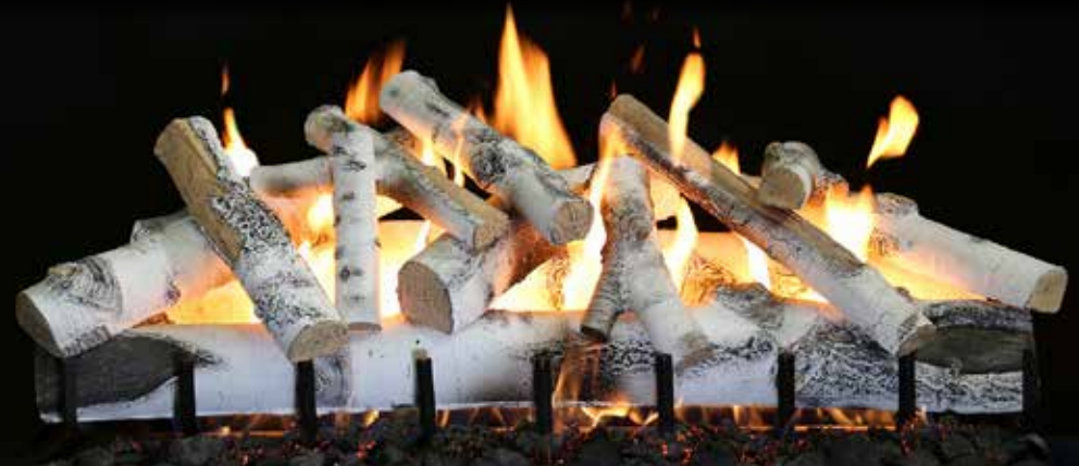
2-Burner Quaking Aspen 42"