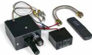
120K (NG & LP) BTU Rating Item # MMVKR-LP or MMVKR-NG