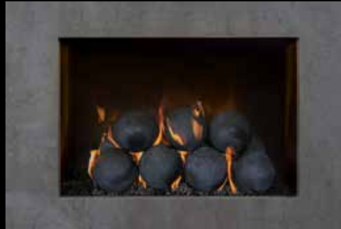
Fireplace Fiber Cannonballs