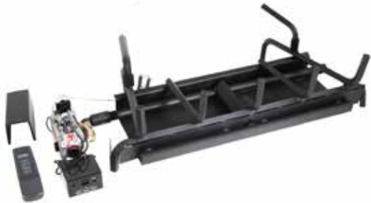
Assembled burner natural gas with millivolt and remote system. 2BRN-##-***-MVK-GCRK