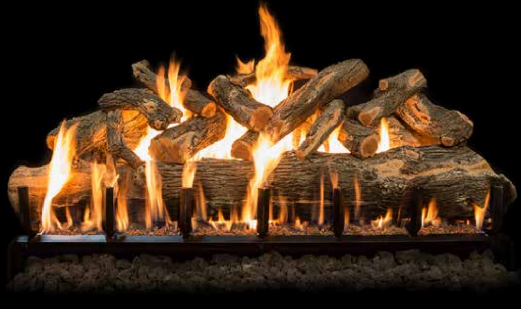
Jumbo-Burner - Jumbo Arizona Weathered Oak 60"