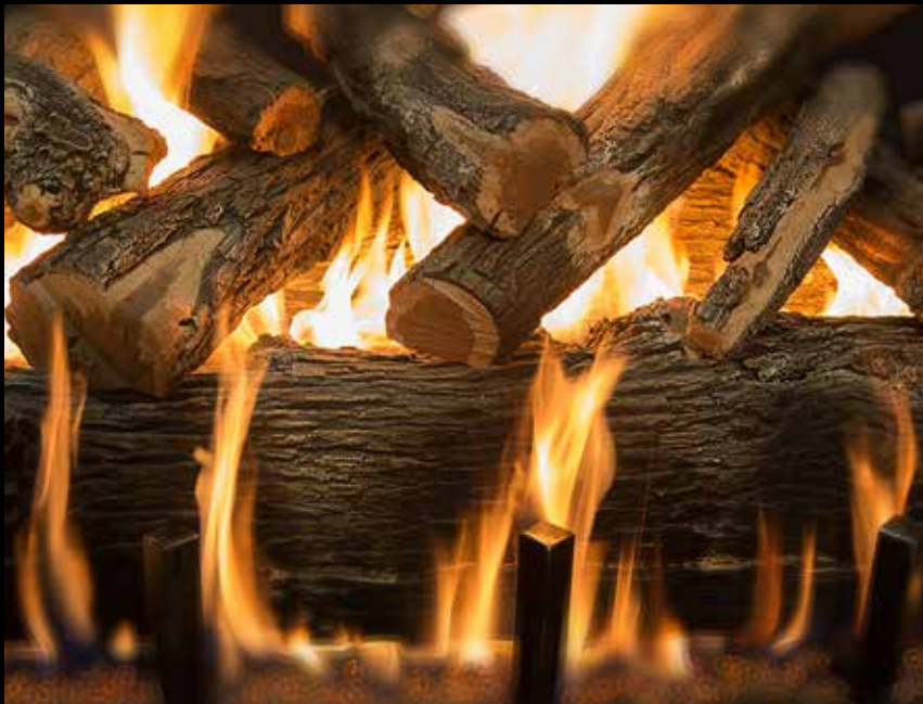
Jumbo-Burner - Jumbo Arizona Weathered Oak 60"