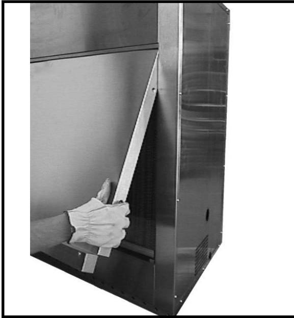
Figure 2 - Slide Cover into Place