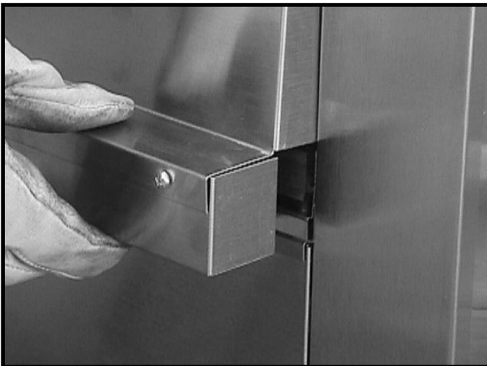
Figure 3 - Sliding Cover Flush