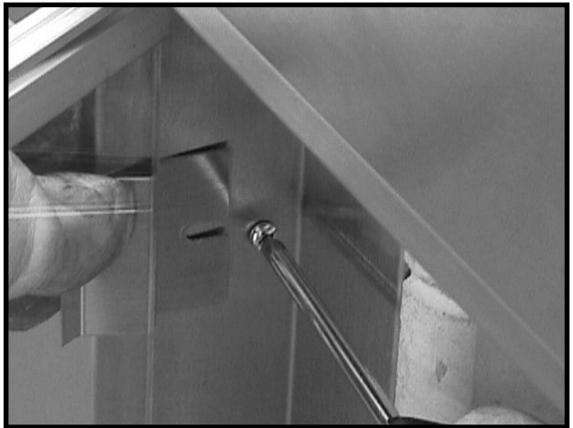
Figure 1 - Loosen Screws